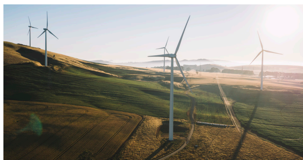
Waubra Wind Farm