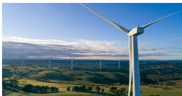
MacIntyre Wind Farm (construction commencement 2022)