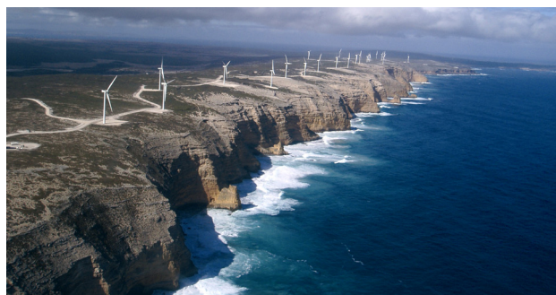
Cathedral Rocks Wind Farm