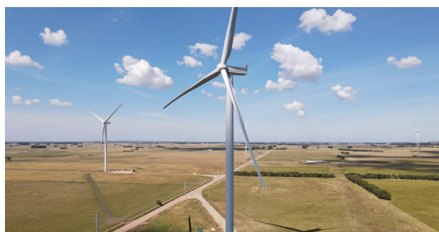
Mortlake South Wind Farm