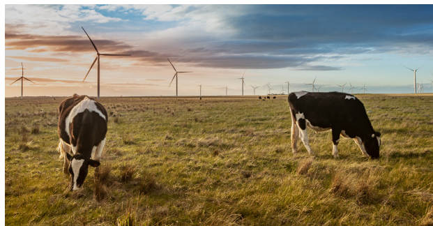
Mt Gellibrand Wind Farm