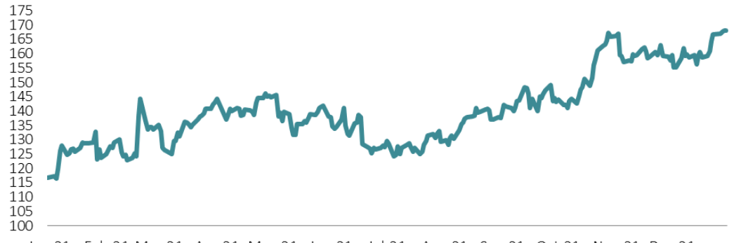
Jan-21 Feb-21 Mar-21 Apr-21 May-21 Jun-21 Jul-21 Aug-21 Sep-21 Oct-21 Nov-21 Dec-21