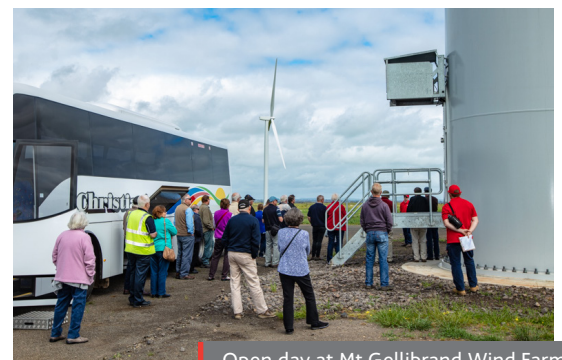
Open day at Mt Gellibrand Wind Farm

After the tour, spend some time getting stuck into food and drinks supplied by local community groups, performances from local musicians and kid's activities. There will also be plenty of renewable energy experts on hand to answer your questions. Keep an eye out in early October for more information on how to register. Keep an eye out in early October for more information on how to register.