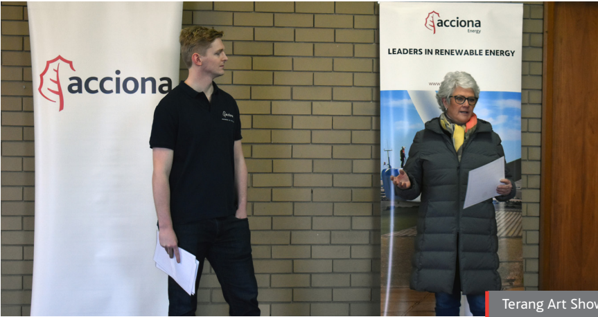
Terang Art Show