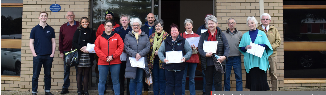
Celebrating Mortlake area's sponsored organisations

ACCIONA recently announced $40,000 in funding across 14 community organisations as part of our annual Sponsorship Program.