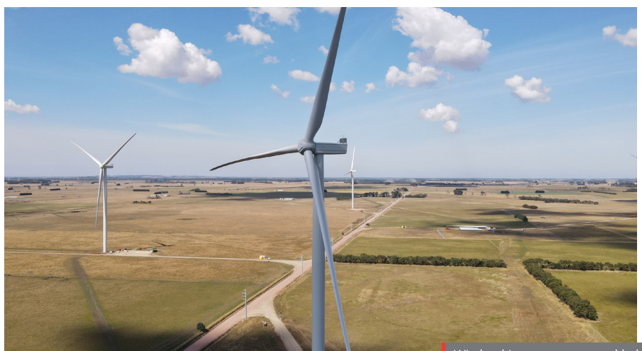
Wind turbines are now assembled

We would like to take this opportunity to once again thank the local community for your patience during our construction works. For additional information on the project, please visit our website: www.acciona.com.au/mortlake