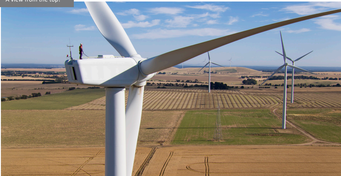
A view from the top!

Wishing you all a happy and safe festive season, Cameron.