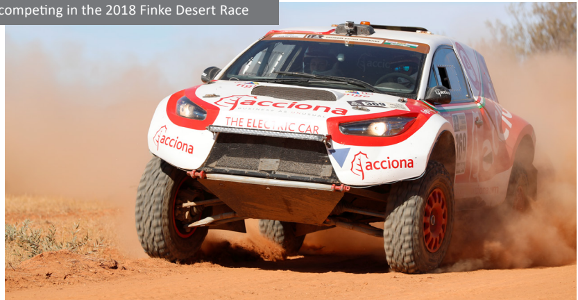
The ACCIONA 100% EcoPowered car competing in the 2018 Finke Desert Race

Participation in the Finke Desert Race has once again demonstrated the competitiveness of renewable energy, and how new technologies continue to push the boundaries not just in energy generation, but also in sport and other areas.