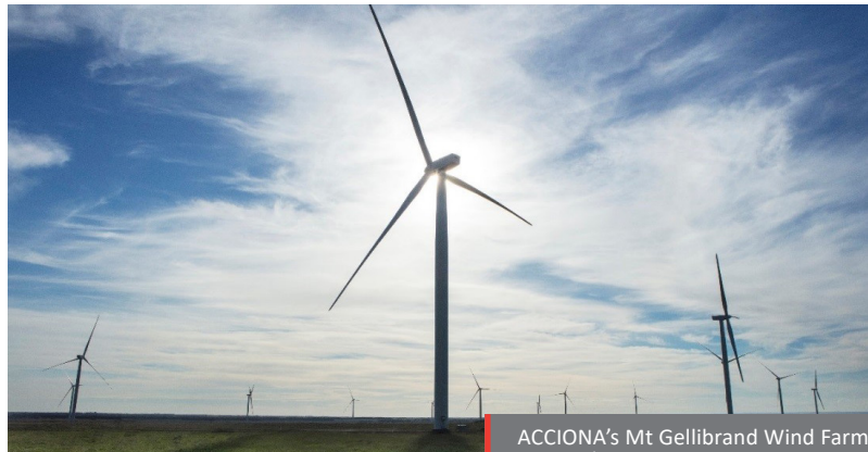
ACCIONA's Mt Gellibrand Wind Farm, near Colac

In addition, ACCIONA's Mortlake South Wind Farm was also successful in the recent Victorian Renewable Energy Auction Scheme. The 157.5 MW project valued at $288 million will commence construction in 2019. This auction result broadens and deepens our investment in Victoria and Australia more generally. Mortlake South will also incorporate a scalable battery energy storage system to help boost performance and integration into the electricity grid.