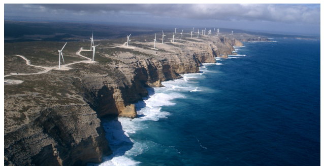
Cathedral Rocks Wind Farm