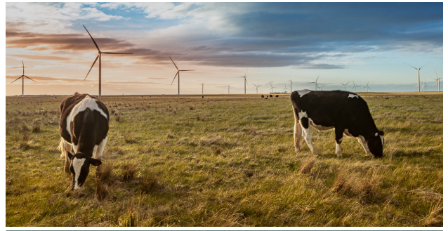
Mt Gellibrand Wind Farm