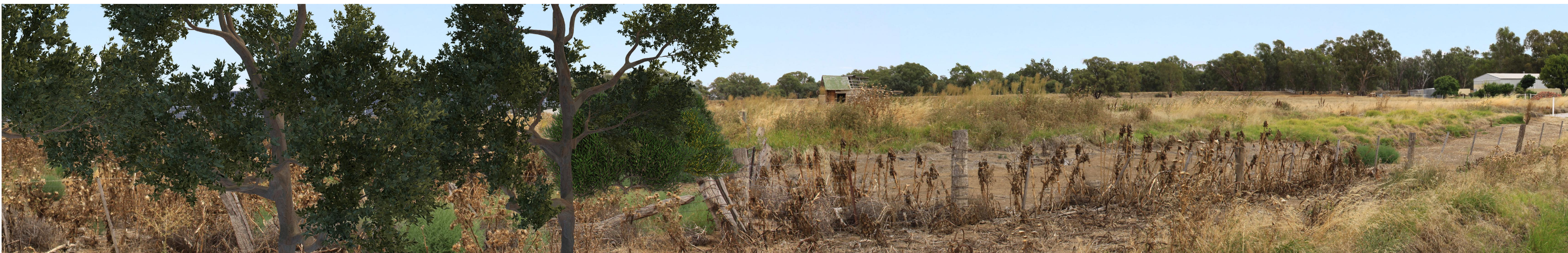
VIEWPOINT 3B - PHOTO MONTAGE: ONCE LANDSCAPE SCREENING HAS MATURED (SOLAR PANELS SHOWN AT MAXIMUM HEIGHT)