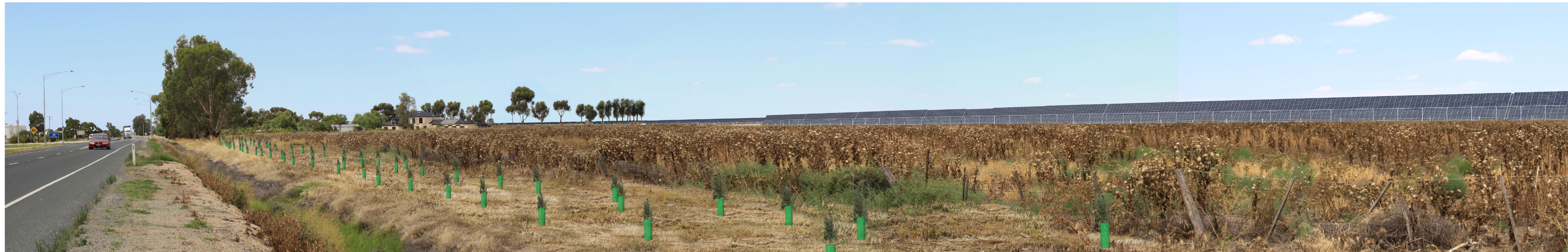
VIEWPOINT 3A - PHOTO MONTAGE: EARLY STAGES AFTER CONSTRUCTION (SOLAR PANELS SHOWN AT MAXIMUM HEIGHT)