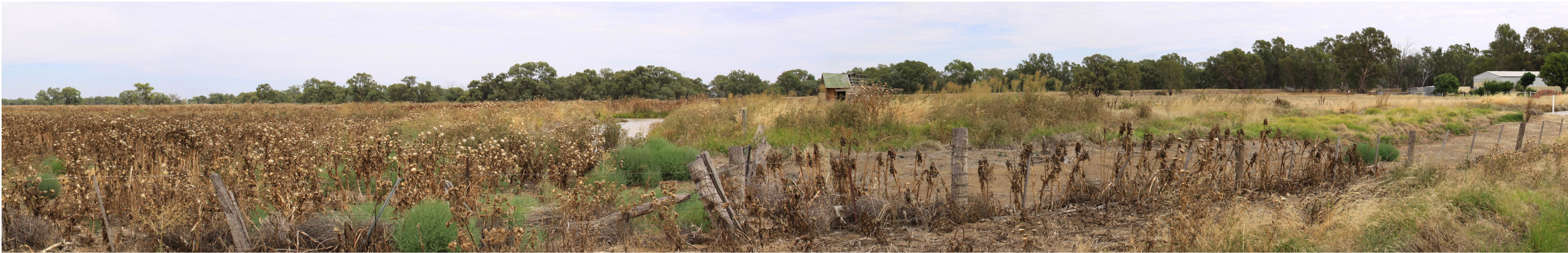
VIEWPOINT 3B - EXISTING CONDITIONS