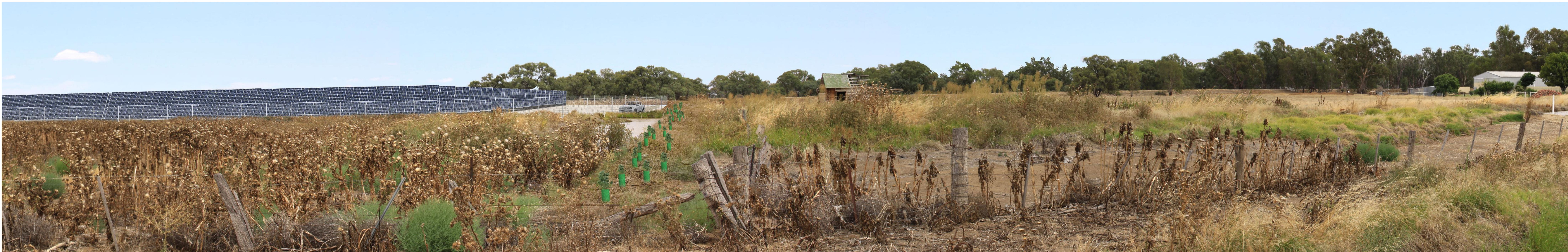
VIEWPOINT 3B - PHOTO MONTAGE: EARLY STAGES AFTER CONSTRUCTION (SOLAR PANELS SHOWN AT MAXIMUM HEIGHT)