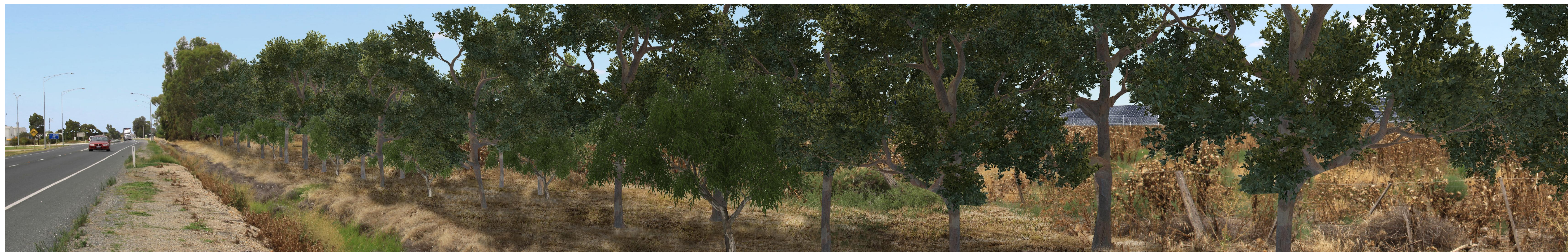
VIEWPOINT 3A - PHOTO MONTAGE: ONCE LANDSCAPE SCREENING HAS MATURED (SOLAR PANELS SHOWN AT MAXIMUM HEIGHT)