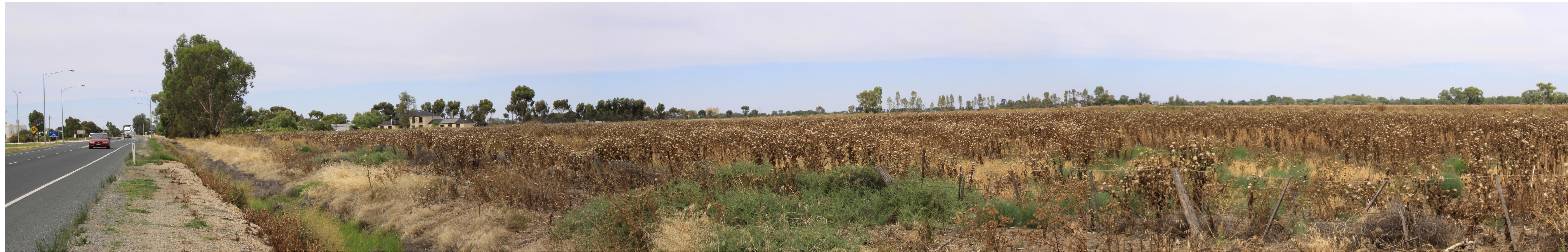
VIEWPOINT 3A - EXISTING CONDITIONS