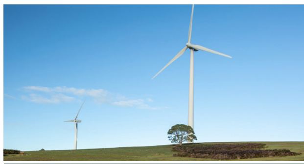
Gunning Wind Farm